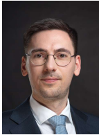
Carsten Lieser Property Market Research