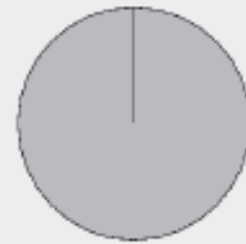
2. Taxonomy-alignment of investments excluding sovereign bonds*